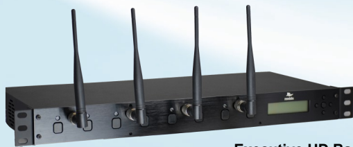
Executive HD Base Station