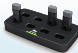
HD Charger Base